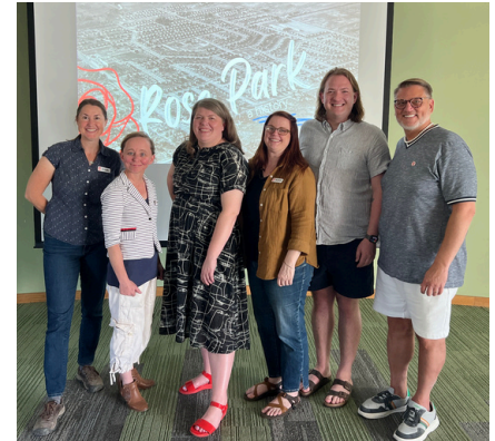
Rose Park Lecture