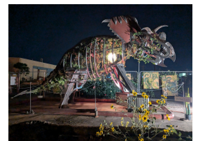
Tabling @ Hoodafest