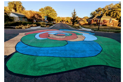
Rose Park Neighborhood 165 attendees