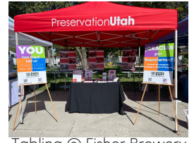
Tabling @ Fisher Brewery