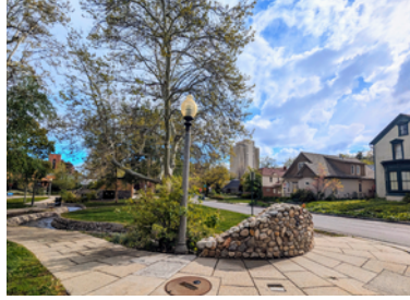
City Creek Neighborhood 580 attendees